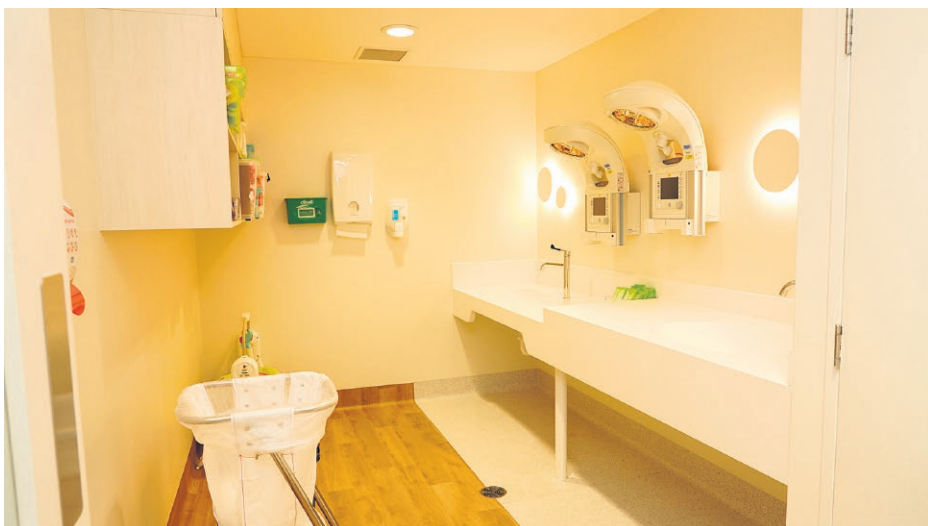
The new and improved Special Care Nursery bathing area, which has two baths and heating fans, as well as products and clothing available for parents.