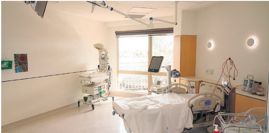
The refurbished birth suites provide a comfortable and safe place for those giving birth.