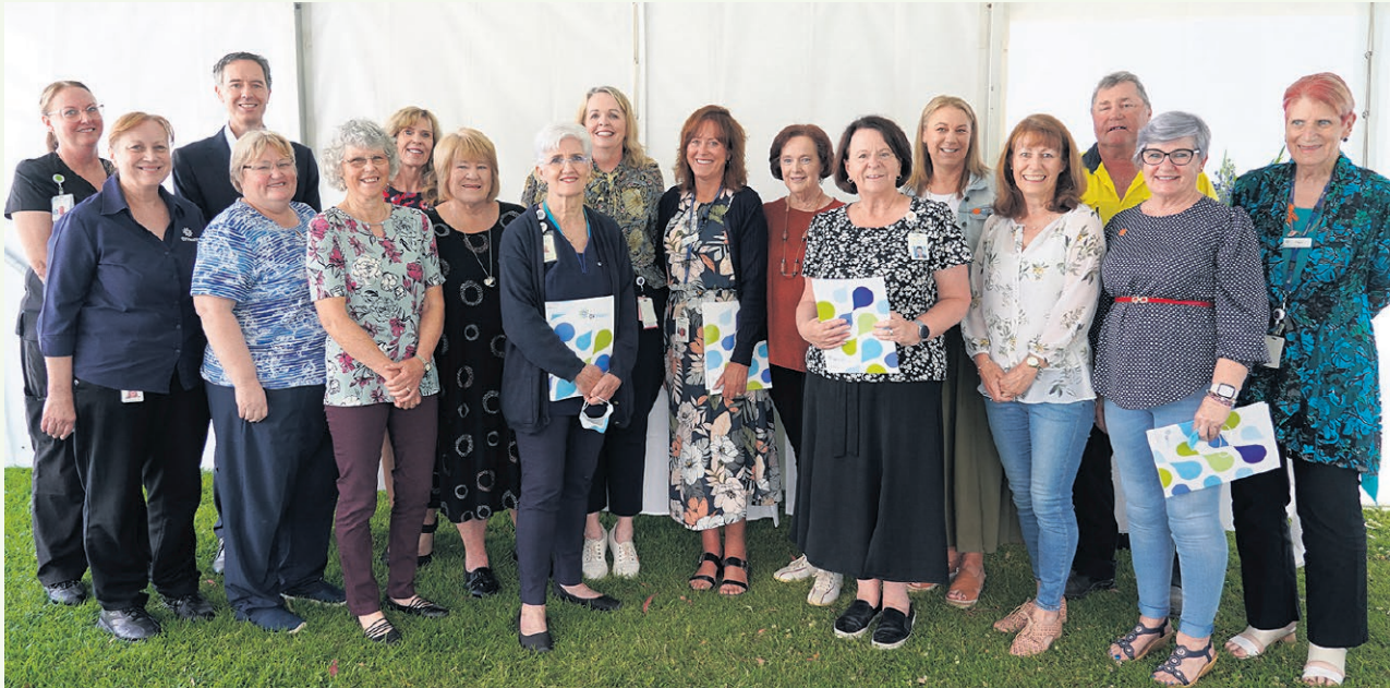
Staff from the GV Health Graham Street campus celebrated up to 40 years of service as valued staff members.

A common theme from staff at the service recognition ceremonies was the connections they have made with their colleagues and the people they have cared for over the years, as well as the difference their work makes to the people in our region.