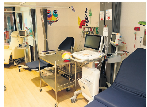
The brightly decorated Child and Adolescent Unit day stay allows patients to have treatment in a comfortable and welcoming environment.