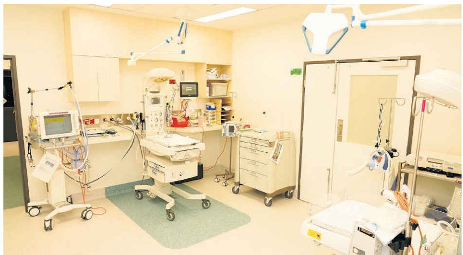
The 'resus' room is a new addition to the Special Care Nursery, allowing staff to use state-of-the-art equipment to provide emergency care resuscitation to infants.