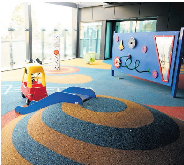
The new playground and playroom gives children in the paediatric area a fun and engaging opportunity to play.