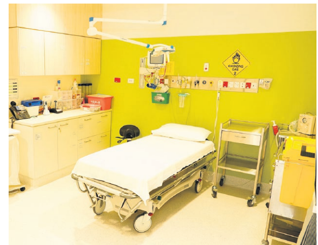
One of the new paediatric treatment rooms for patient procedures.

Completed and upcoming works will help GV Health provide first-class service and high-quality care to patients and clients in the Goulburn Valley region.