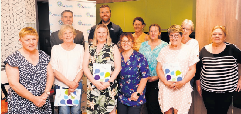
The GV Health Rushworth campus is home to several staff who have served for many years, from 10 years of service all the way up to 35 years.