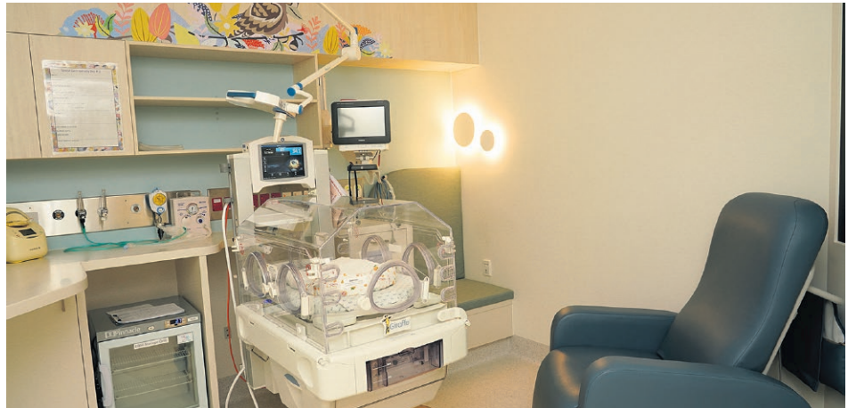
The Special Care Nursery now has two isolation rooms, which lets babies under a month old to isolate before they're placed near other children.