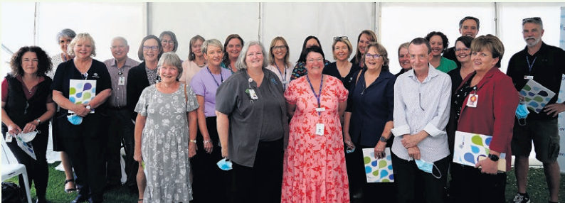
More Graham Street campus staff celebrated lengthy terms of service in all areas, from clinical to administrative and everything in between.